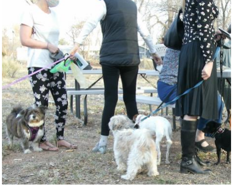
Holy Hikes, Christ's Church, Castle Rock; Paws for a Blessing Service, Church of the Nativity, Grand Junction