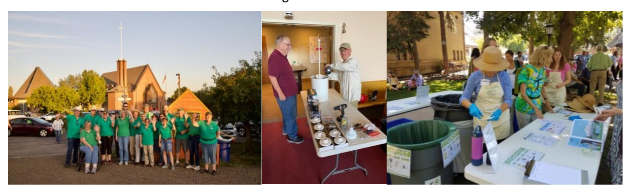
Holy Comforter, Broomfield, Green Team; Converting Lights to LED, St. Michael's, Colorado Springs; St. John's Cathedral Green Team Event