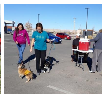
Creation Care Camp at Cathedral Ridge; Adopt-a-Trail Cleanup, St. Michael's, Colorado Springs; Spay & Neuter Clinic on Navajo Nation Supported by Church of the Nativity, Grand Junction