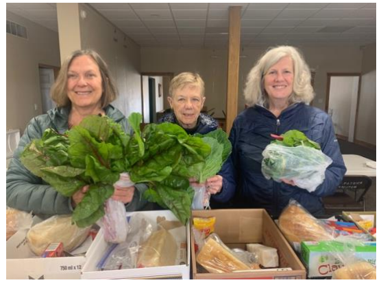
Broomfield Farmers' Market FISH (Fellowship in Serving Humanity) Donations, Holy Comforter, Broomfield; Produce Grown to Help Stock Local Food Pantry, St. Patrick's, Pagosa Springs