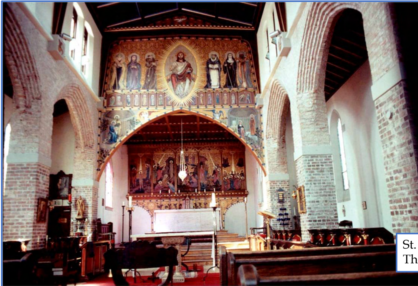
St. Andrew's interior, 1969-1984 The art on the far wall remains today!

Average Sunday Attendance: 100 Average Weekly Attendance (including weekday services): 131 Easter attendance: 313 Participants in adult formation programs: 45 Average participants in weekly children/youth formation: 6 LGBTQ+: percent of congregation (estimated) LGBTQ+ 25% Approved 2024 Budget: $564,486 Operating Expenses Endowment Balance: $456,000