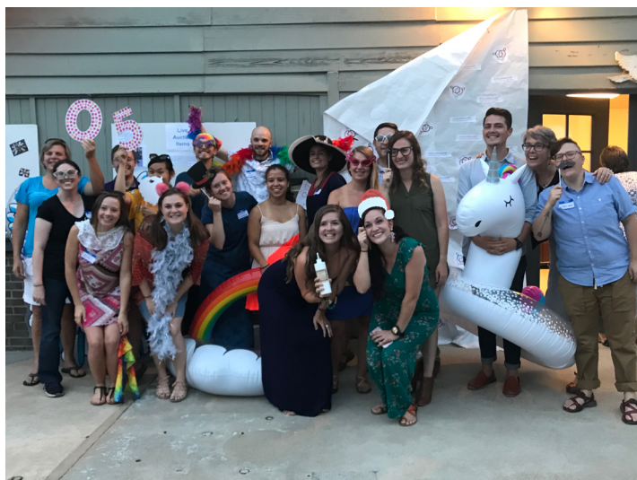
Corps members, staff and alumni at the July 20, 2018 Birthday Bash and Fundraiser

If you would like a Colorado ESC corps member to come to your congregation please contact us! We are happy to have a corps member preach, present a forum, lead a formation session with your youth or young adults. We'd love to explore what other ideas you might have.