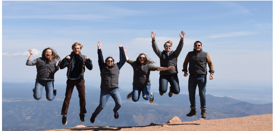
CO-ESC Corps members at the St. Columba House Blessing November 2017