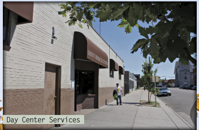
Day Center Services