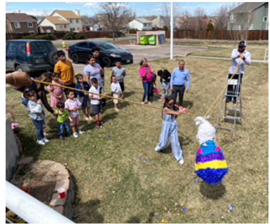
Easter Party - 2023