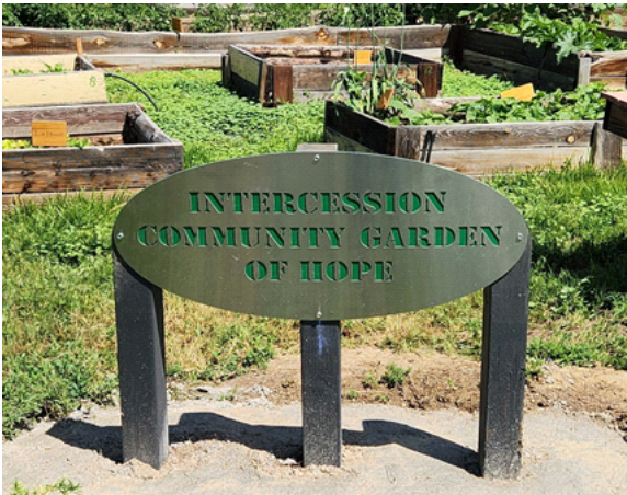
Donated sign in Memory of deceased garden volunteers