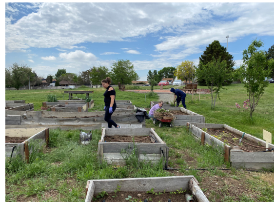
Volunteers preparing 2023 Community Garden beds