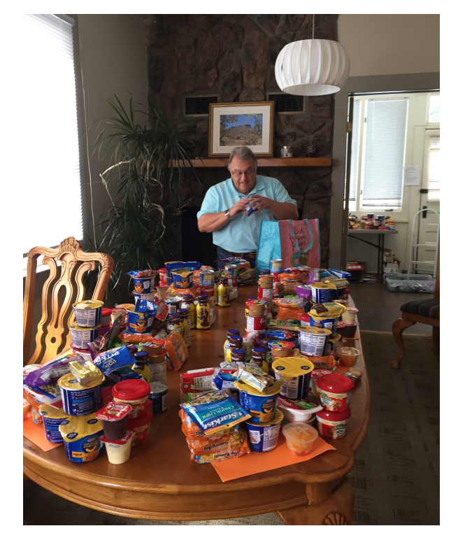
are the main resources for our shelf

Although, our parishioners are very generous, grant monies are essential to sustain our ministry. During the spring term, we received cash gifts from our members ranging from $5-$1500 and $2050 in gifts-in-kind. Coupled with the January grant we were able to begin restocking the pantry July 24th. The August 1st installment will provide over half of the seed money for the fall term.