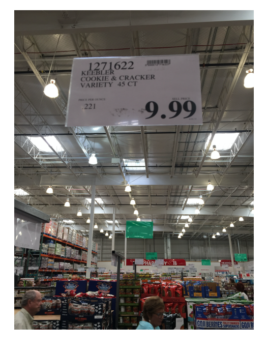
Sam's Club, Walmart and Costco