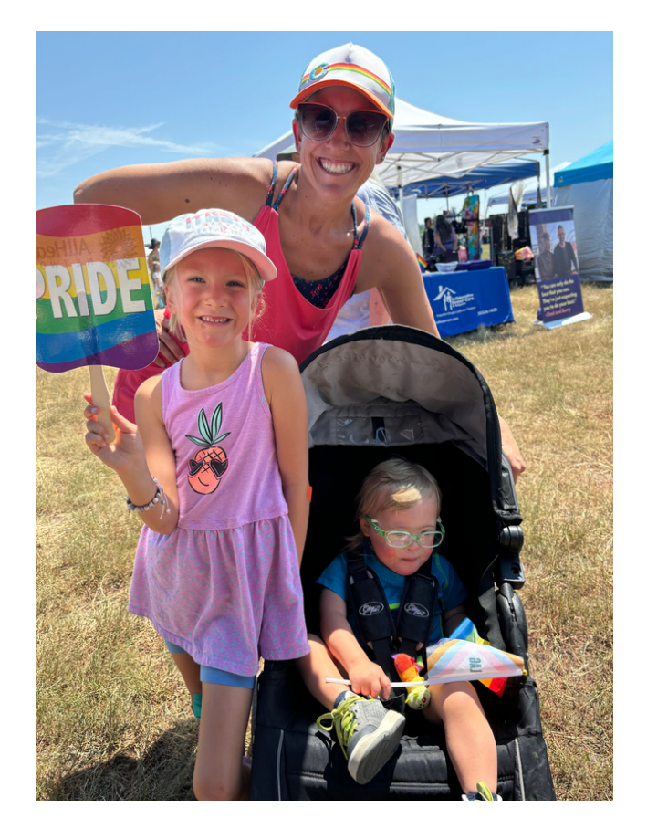
Holy Companion participated in the affirming churches booth at Douglas County PrideFest on August 4