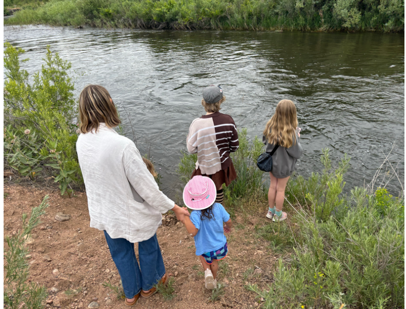
Our second Joy in Creation nature prayer walk at the Audubon Society in July. We walked along the Platte River using our senses to notice God's love present with us. The children loved it! One of our youth said, "I like this better than sitting church."