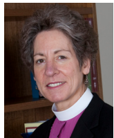
The Right Reverend Katharine Jefferts Schori, 26th Presiding Bishop of The Episcopal Church

We'll look at current realities and predictions of the future that vary depending on our responses. Faithful living and loving all our neighbors as ourselves can mean more abundant life for all. A handful of very concrete actions can make very significant differences. Come and learn how to change the world!